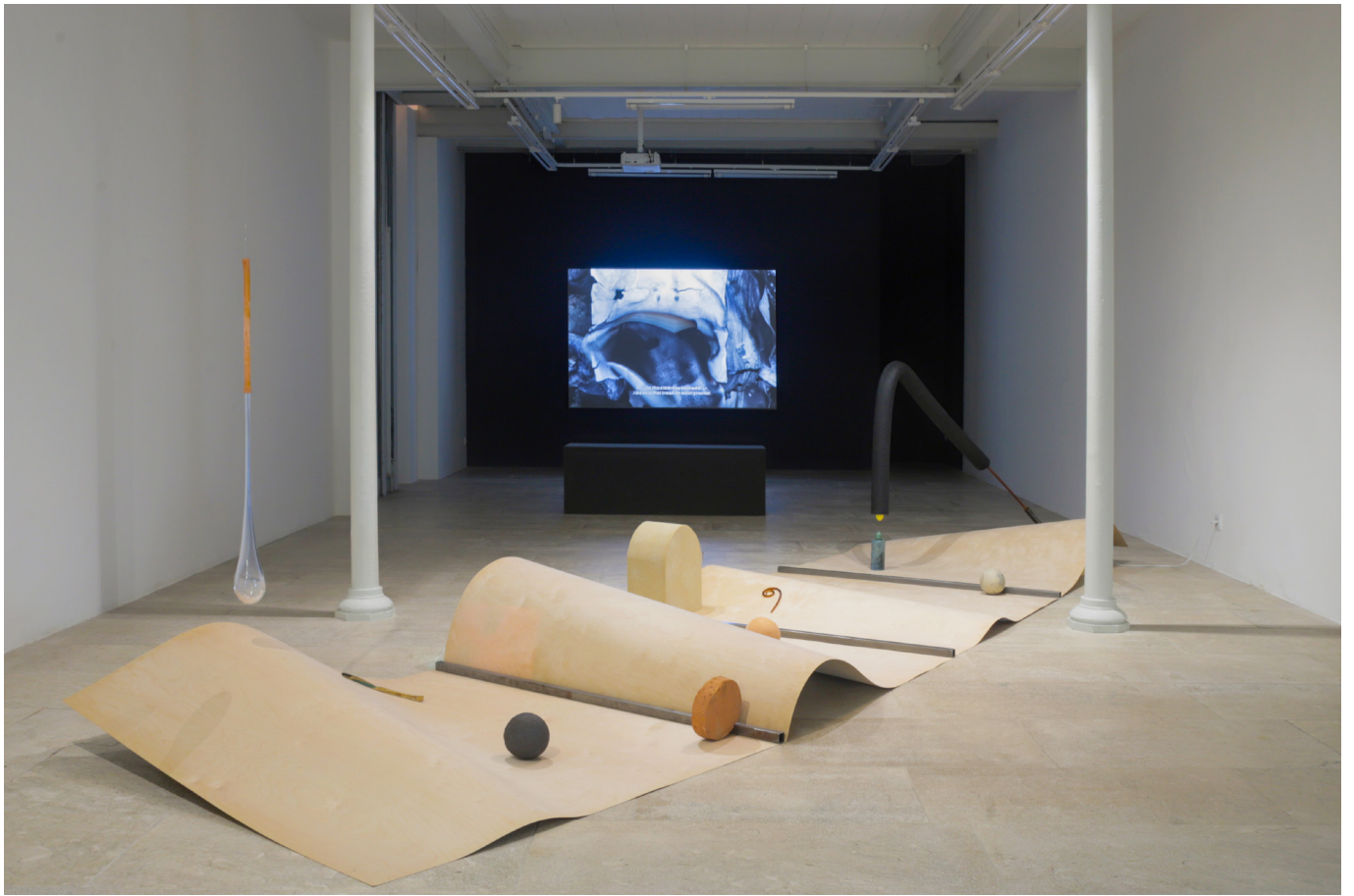
Rizoma / Rhizome Exhibition View